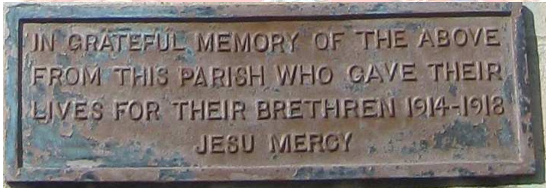
CENTRAL PANEL BELOW THE CRUCIFIX