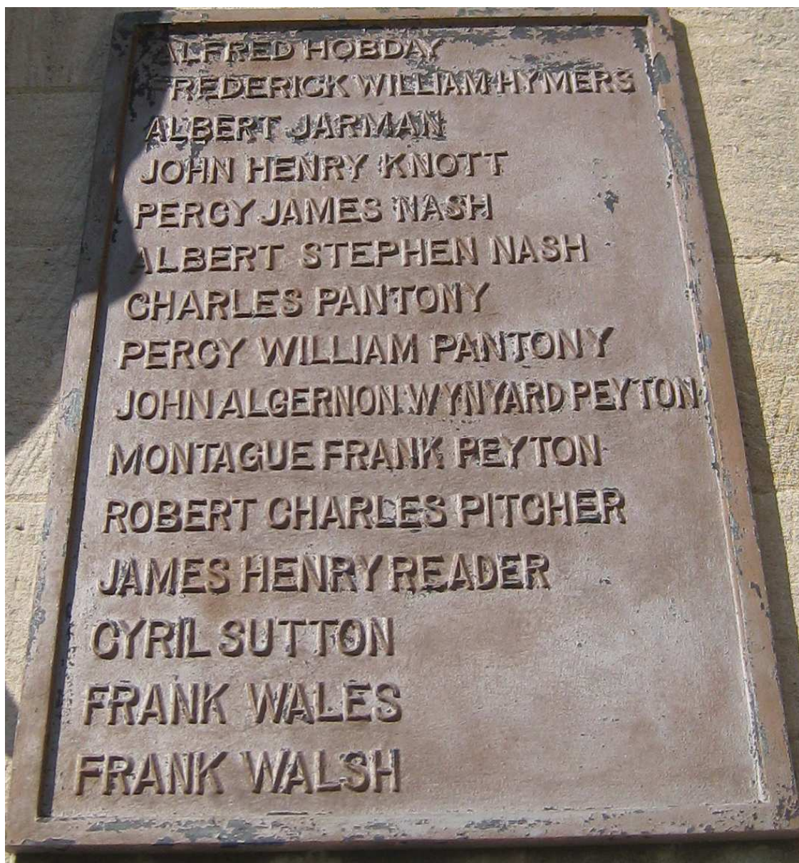
RIGHT HAND COMMEMORATION PANEL